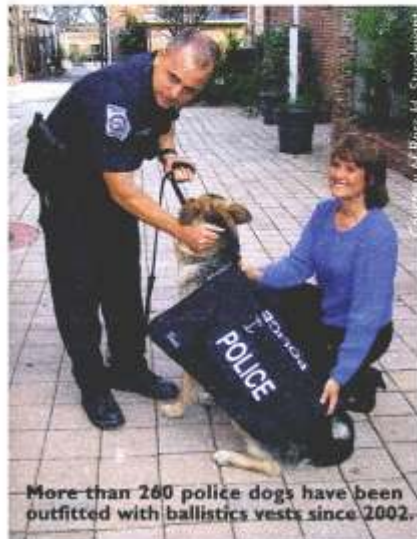
More than 260 police dogs have been outfitted with ballistic vests since 2002.